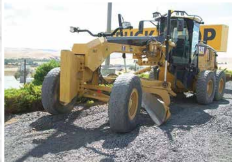
2008 Cat 140M