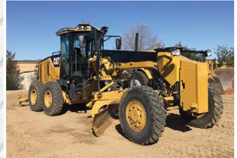
2010 Cat 120M AWD