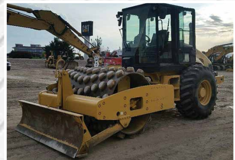
2007 Cat CP563E

Visit www.IronPlanet.com to view inspection reports.