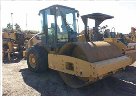
2012 Cat CS56 (1 of 3)