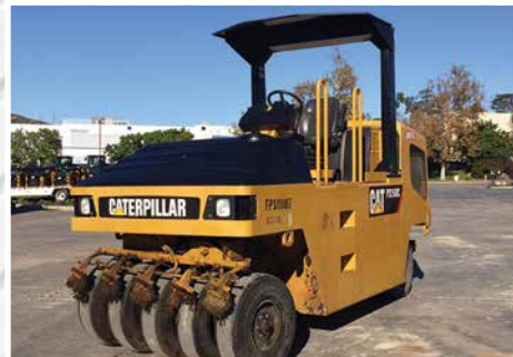
2011 Cat PS150C

Visit www.IronPlanet.com to view inspection reports.