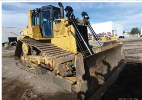
2012 Cat D6T LGP