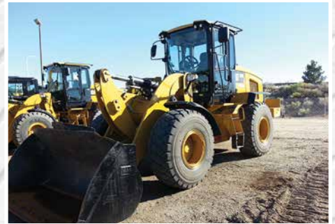
2012 Cat 938K (1 of 2)