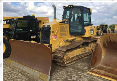
2011 Cat D6K XL (2 of 2)

Visit www.IronPlanet.com to view inspection reports.