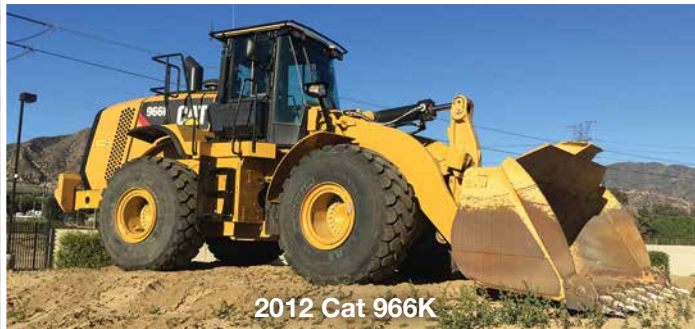
2012 Cat 966K