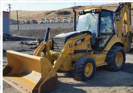
2009 Cat 450E 4x4