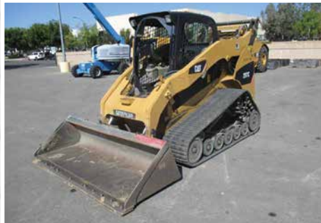
2007 Cat 297C (1 of 3)