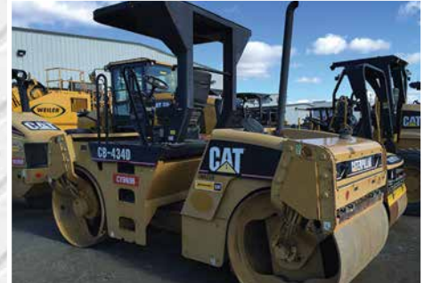
2005 Cat CB434D