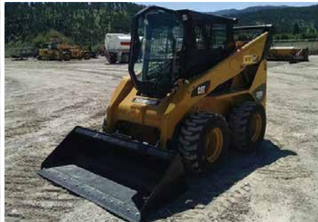
2014 Cat 252B3