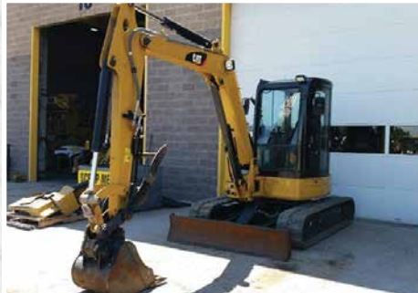
2013 Cat 305.5E CR

2012 Cat 308E CR 2012 Cat 308D 2013 Cat 305.5E CR 2012 Cat 305D CR 2011 Cat 305.5D CR (2) 2012 Cat 303.5E CR 2012 Cat 302.5C (3) 2012 Cat 301.8C 2013 Cat 301.7D 2012 Cat 301.4C Kubota KX161-3 (2) Kubota KX121-3 Kubota KX121-2