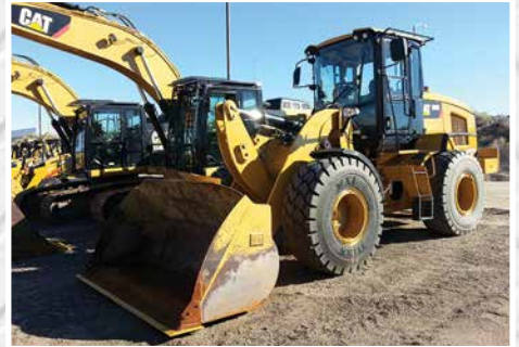
2012 Cat 930K (1 of 2)

Visit www.IronPlanet.com to view inspection reports.