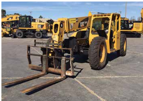
2008 Cat TL642*