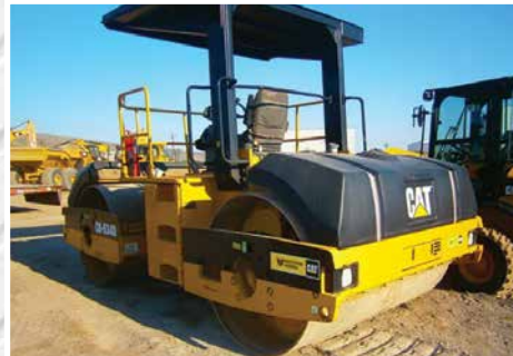
2005 Cat CB634D (1 of 4)