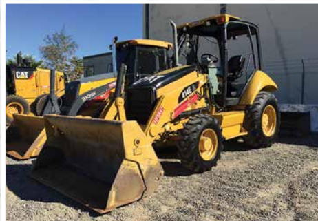
2007 Cat 414E (1 of 2)