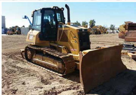
2011 Cat D6K XL (1 of 2)