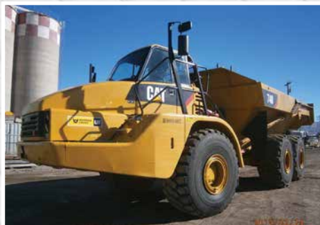
2007 Cat 740 (1 of 2)