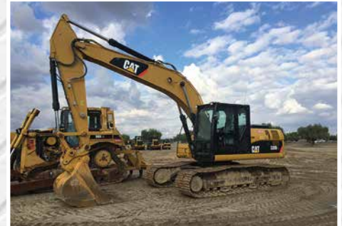
2011 Cat 320DL