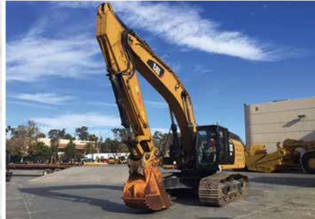
2011 Cat 349EL*

2011 Cat 349EL* 2012 Cat 336EL 2011 Cat 336EL 2005 Cat 330CL 2012 Cat 329EL 2009 Cat 328DL 2002 Cat 322C LR 2012 Cat 320EL 2012 Cat 320DL 2011 Cat 320DL 2012 Cat 316EL 2012 Cat 312EL