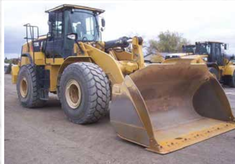
2014 Cat 972K

2012 Cat 980K 2013 Komatsu WA500-7 2012 Komatsu WA500-7 2014 Cat 972K 2012 Cat 966K 2007 Cat 966H* 2012 Cat 950K (2) 2013 Volvo L110G 2013 Volvo L90G 2012 Cat 938K (2) 2010 Cat 938H 2012 Cat 930K (2)