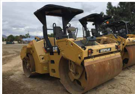
2011 Cat CB54 XW