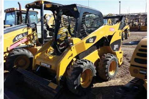
2012 Cat 262C