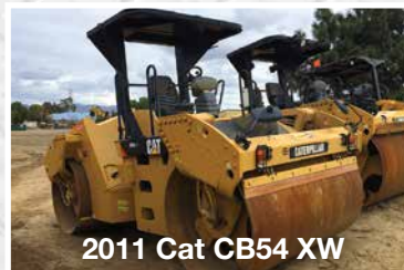
2011 Cat CB54 XW