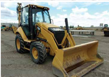
2014 Cat 420F 4x4