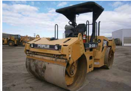
2007 Cat CB534D XW