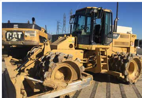
2008 Cat 815F Series II