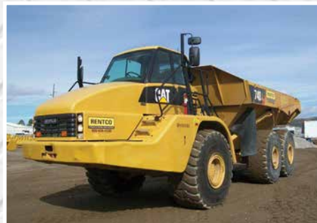
2007 Cat 740 (2 of 2)