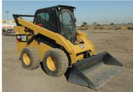
2014 Cat 262D