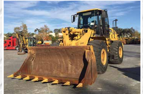
2007 Cat 966H*