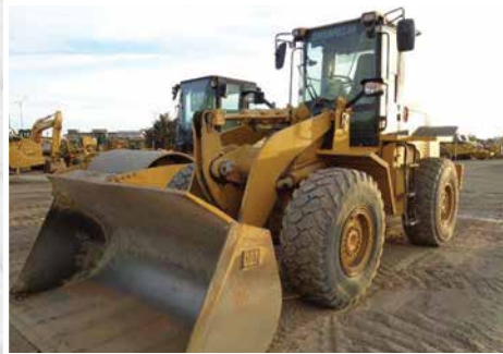
2010 Cat 938H

2007 Genie Z45/25 Articulating Boom Lift 10,000 gal. Portable Water Tower