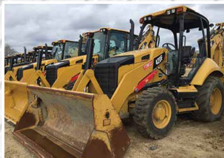
2012 Cat 420F 4x4 (8)

Visit www.IronPlanet.com to view inspection reports.