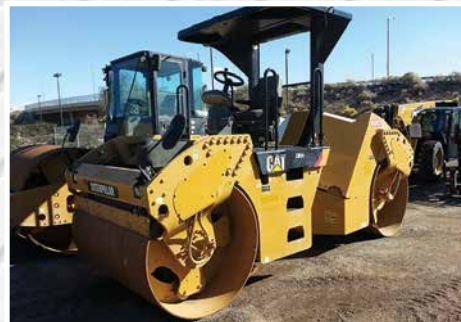
2011 Cat CB54 (1 of 3)

Visit www.IronPlanet.com to view inspection reports.