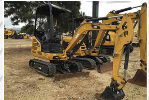
2012 Cat 303.5E CR