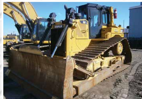
2011 Cat D6T LGP