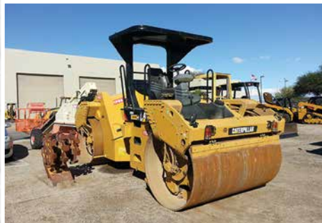
2011 Cat CB64 (1 of 2)