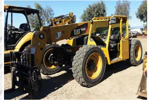
2012 Cat TL642C (1 of 3)