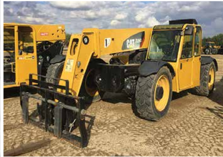
2012 Cat TL 1055C (1 of 2)

2011 Cat TL1255 2013 Cat TL1055C 2012 Cat TL1055C (2) 2012 Cat TL943 (6) 2011 Cat TL943 2012 Cat TL642C (3) 2008 Cat TL642* 2012 Cat TH255