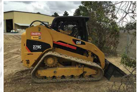
2011 Cat 279C (1 of 3)