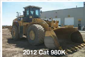
2012 Cat 980K