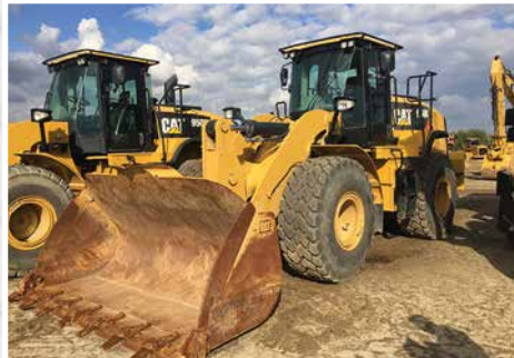
2012 Cat 950K (1 of 2)