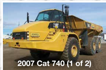
2007 Cat 740 (1 of 2)